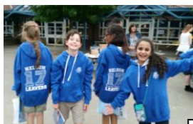
Hoodies, Yearbook & BBQ Party for Year 6 Leavers (last July 2017)