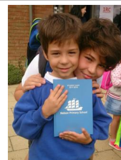
Student diaries for all Nelson pupils.