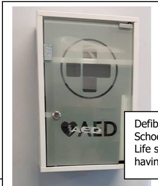
Defibrillator (kept outside the School Office). Life saving equipment for anyone having a cardiac arrest.