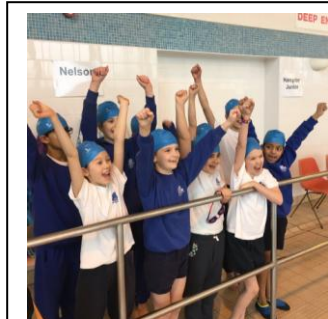
Swimming gala training sessions - years 3 / 4 / 5 & 6 children. GOOD LUCK FOR THE GALA ON 8TH FEBRUARY SWIMMERS..!