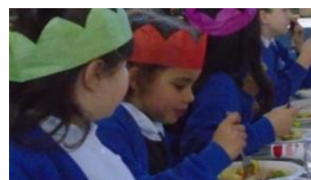
Christmas Dinner & Crackers for all Nelson children (Dec 2017)