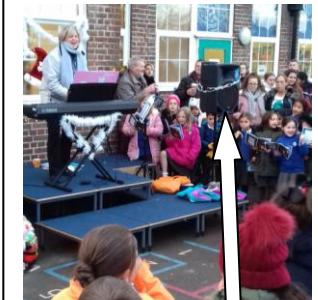
P.A System & microphone - as used at the Christmas Carols in the playground & Winter Fair (Dec 2017). Also to be used for Sports Days etc.

PLEASE HELP to Support your PTA, HOWEVER YOU CAN. THANK YOU.