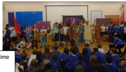
Interactive Christmas Pantomime 'Aladdin'. For all year groups. (Dec 2017)