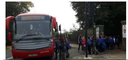
Coach trips for all year groups - £3500 has been contributed by the PTA to help fund school trips this year. £5000 will be spent on coaches for swimming lessons.