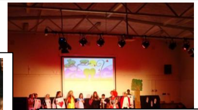
Permanent Stage lighting in the Main Hall for all productions